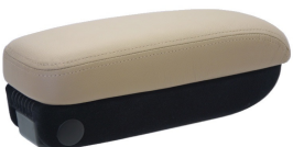
MLC310-F11L30 Black Anthracite-Beige