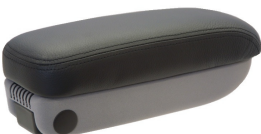
MLC310-F21L10 Light grey-Black