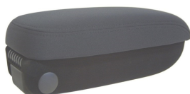
MLC310-F11T10 Black Anthracite-Black