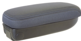
MLC310-P10T11 Black-Black Anthracite