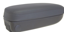
MLC310-P10V11 Black-Black Anthracite