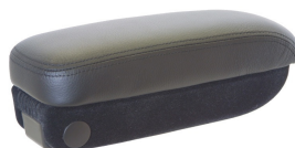
MLC310-F11L10 Black Anthracite-Black