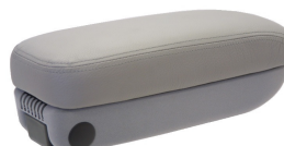
MLC310-F21L21 Light grey-Light grey