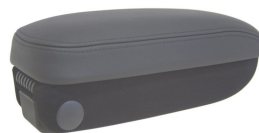
MLC310-F11V10 Black Anthracite-Black