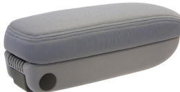
MLC310-F21T21 Light grey-Light grey