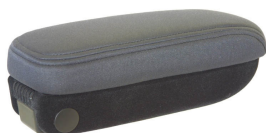
MLC310-F11T11 Black Anthracite- Black Anthracite